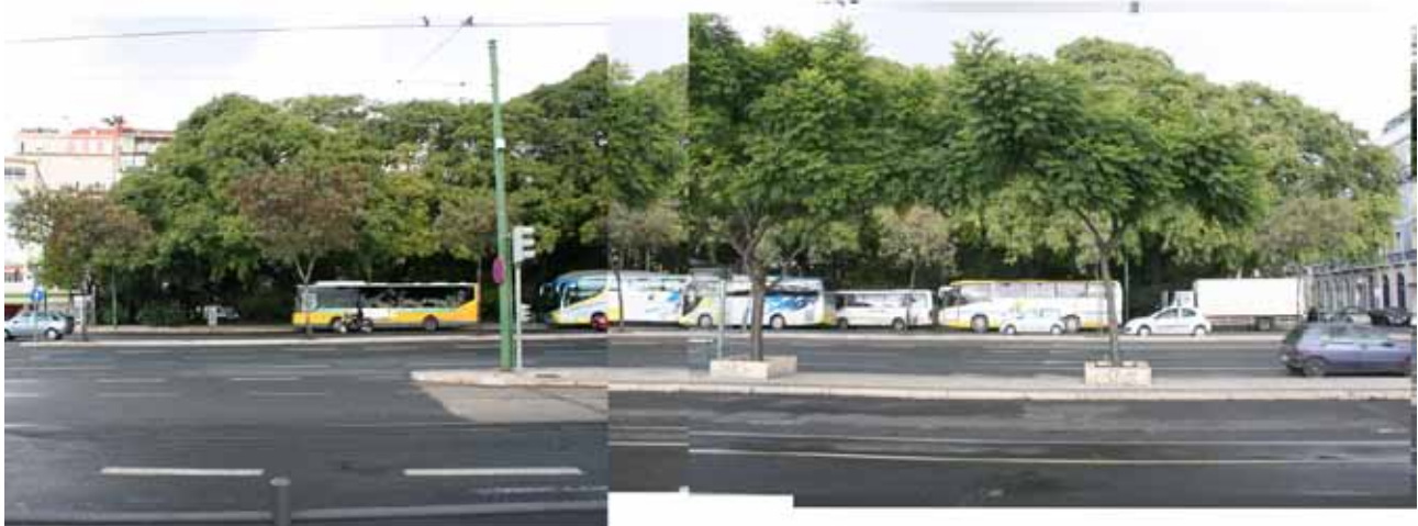
Jardim de Santos