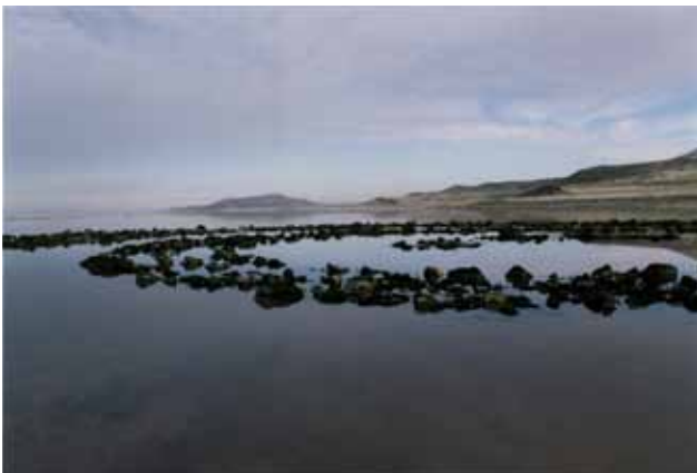
Casting a Glance © James Benning