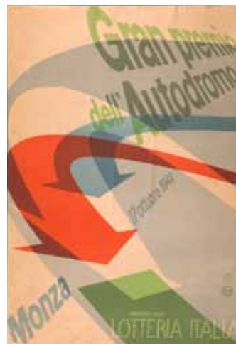
Max Huber Grand Premio dell'Autodromo, Monza