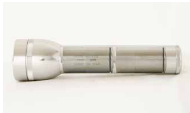
Auger-Loizeau Memorial torch with afterlife cell